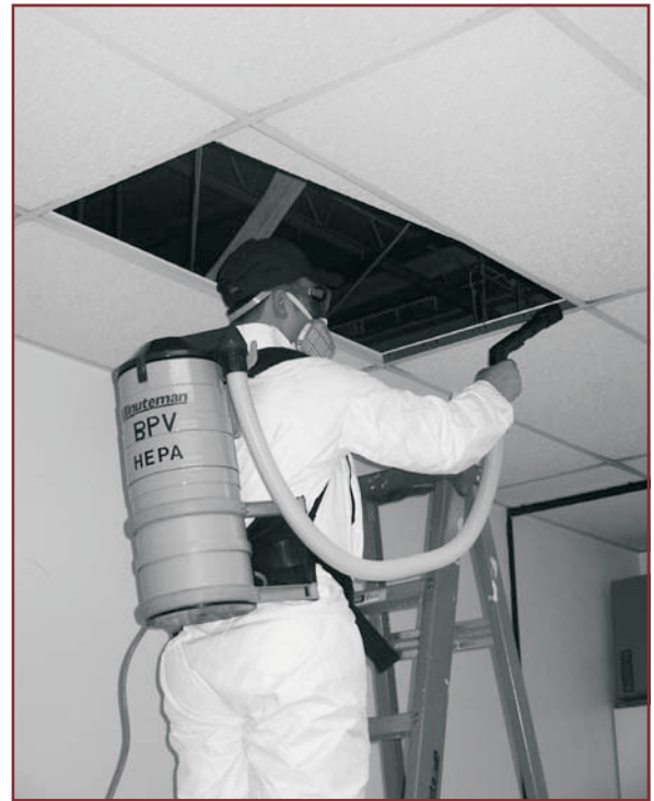
The H.E.P.A. Back Pack Vacuum is lightweight and versatile, it can go virtually anywhere. Shown with optional dust brush.